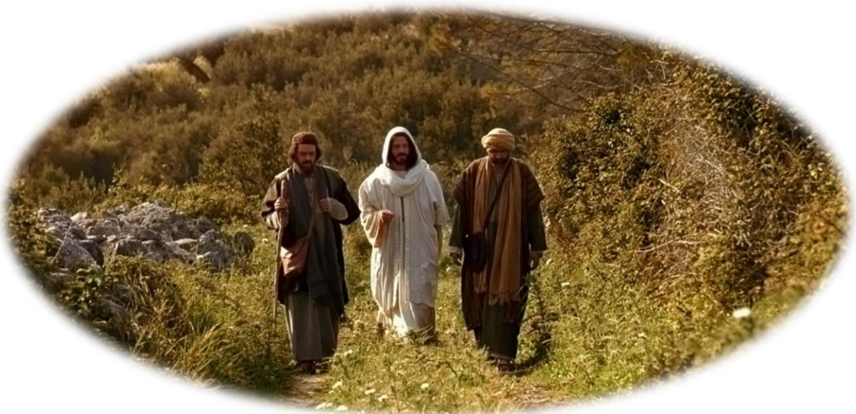
Christ appears on the road to Emmaus

Date and time for next meeting: Thursday, May 23, 2019, at 10:00 AM. The group will discuss future meeting dates and time.