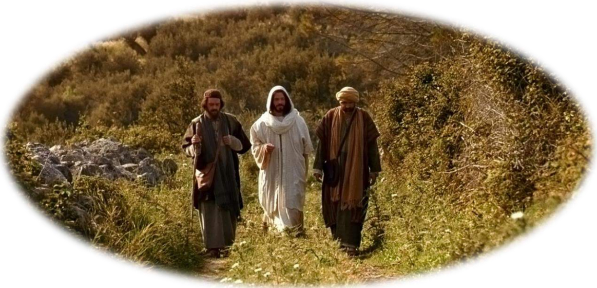
Christ appears on the road to Emmaus

Date and time for second meeting: Thursday April 25th, 2019, at 10:00 AM. The group will discuss future meeting dates and time.